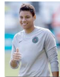
Franch, 2016. By Ray Terrill - N42A2647.jpg, CC BY-SA 2.0.**