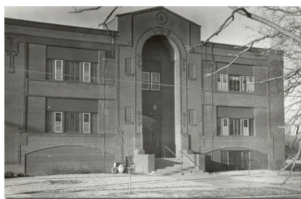
Dunbar School, 1920s.

Carver Center parking lot, 315 North 2nd Street. For years, this area served as the hub for many activities in the Black community. Dunbar School, to the southeast, at 509 E. Elm Street, was Salina's K-8 segregated school. It operated from 1922 until 1955 and today houses St. Francis Community Services. Carver Pool, the Black public swimming pool, sat just south of Carver Center. Built in 1948, it eventually integrated and was later demolished in 2001. Carver Center itself, was also built in 1948 and torn down to make way for the current center, dedicated in 1979. Near the center is the John Parker Jr Memorial Park. To the north of Dunbar, at 345 North Front was the Booker T. Washington Community Center. It was built in the 1930s and sold in the late 1940s. Money from the sale financed scholarships for Black students.